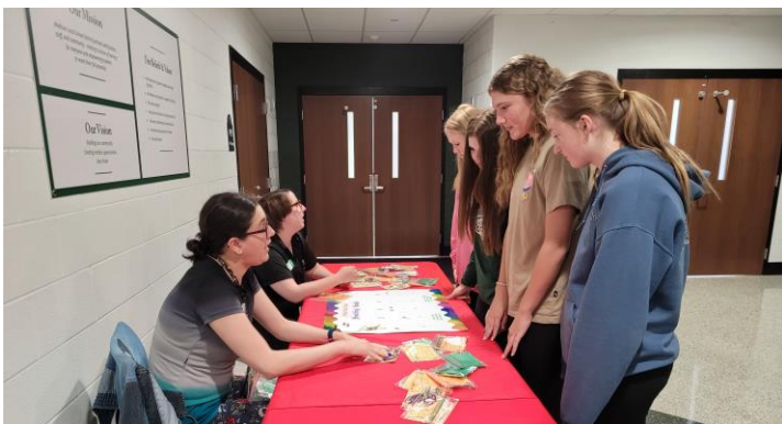
May is Mental Health Awareness Month! Staff from CACY (Community Action for Capable Youth) were available during student lunches to hand out breathing bead kits. They are used as part of a deep breathing activity for healthy focus skills.